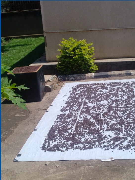
Tarpaulin Tradition 14-17 days