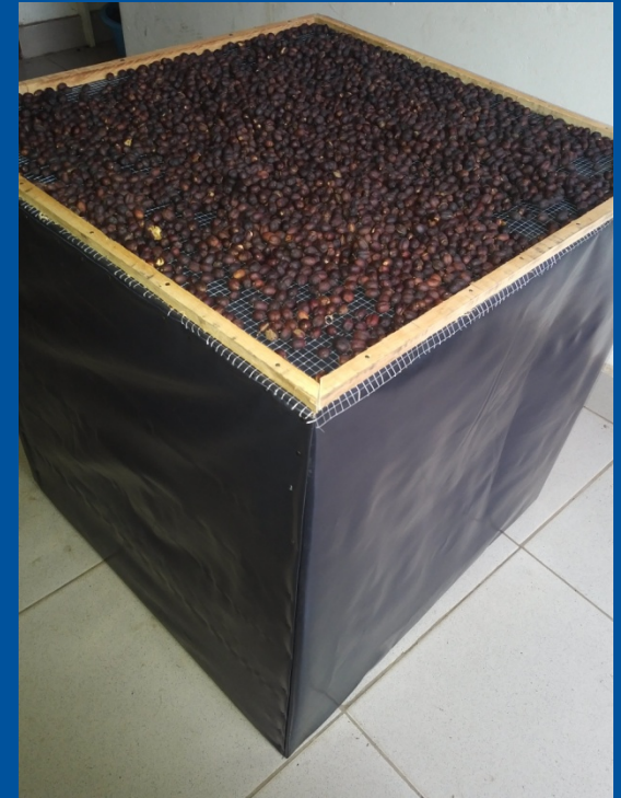
“Black Box” 8 days estimated