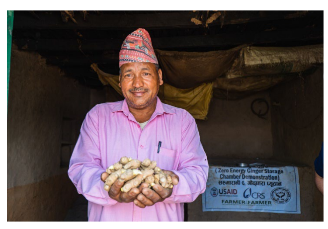
A member of F2F partner organization, the Airawati Multipurpose Small Farmers Society presents fresh ginger which has benn effectively stored using techniques learned through a F2F volunteer assignment. While farmers used to sell fresh ginger at low prices, storing ginger while preserving its freshness allows themto sell when ginger prices are higher.

When the COVID-19 pandemic started, US volunteers who were unable to travel provided remote support to local volunteers who directly supported the host partners.